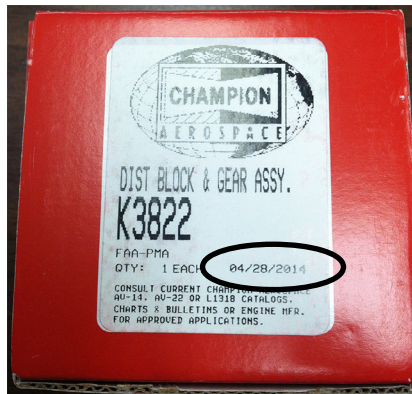
Figure 1. Replacement Kit Box Label Date Code

If it is not possible to confirm the version of the distributor gear that is installed in a given magneto from maintenance records, the magneto may be removed from the engine in order to have the housing and distributor block removed to allow visual inspection of the distributor gear. Distributor gears with Copper electrodes must be replaced with distributor gears with Monel electrodes.