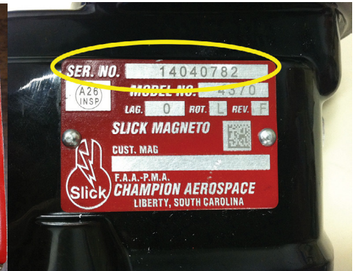
Figure 2. Magneto ID Label Date Code

* Changes from SB1-15 initial release in red