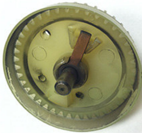
Figure 3. Affected K3008 Distributor Gear With Copper Electrode

COMPLIANCE: REMOVE affected distributor gear assembly in subject magnetos and REPLACE with replacement distributor gear assembly, K3008, as soon as possible, not to exceed the next 50 hours. Document Service Bulletin compliance as written entry in applicable Aircraft and/or Engine logbook.