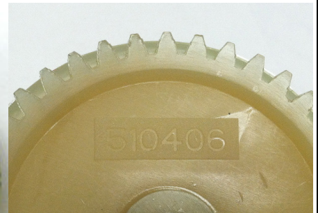
Figure 4. K3008 Distributor Gear Marked 510406 (Backside)

* Changes from SB1-15 initial release in red