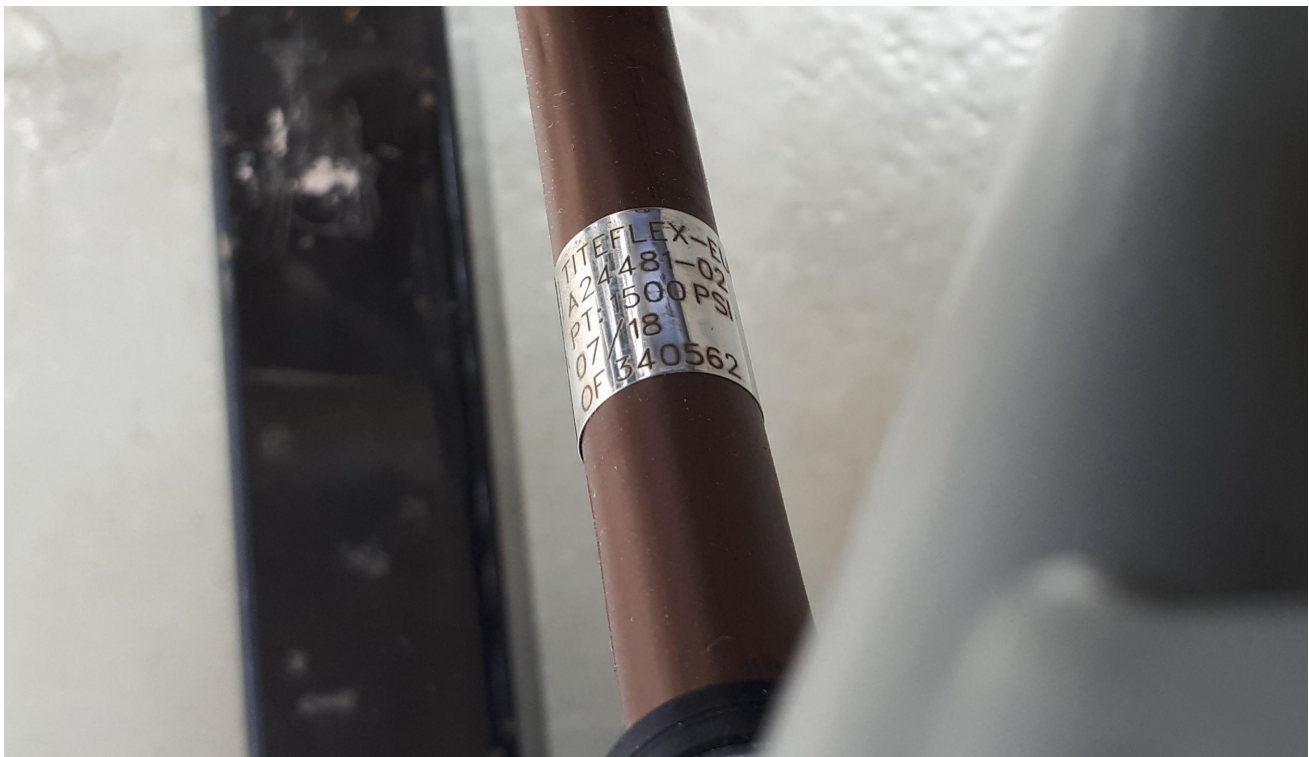
Figure 2: Fuel hose with correct part number A24481-02 (second line from top).