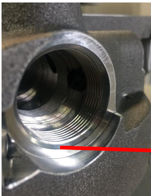
Fig. 1: Gearbox filter housing