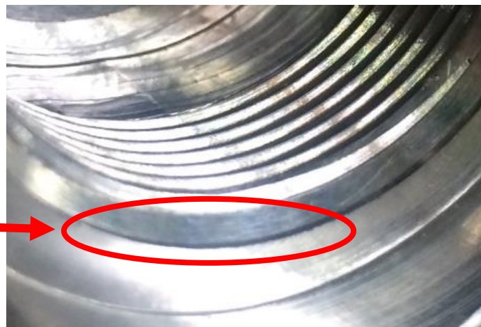
Fig. 2: Detail (burr detected - within the red oval)