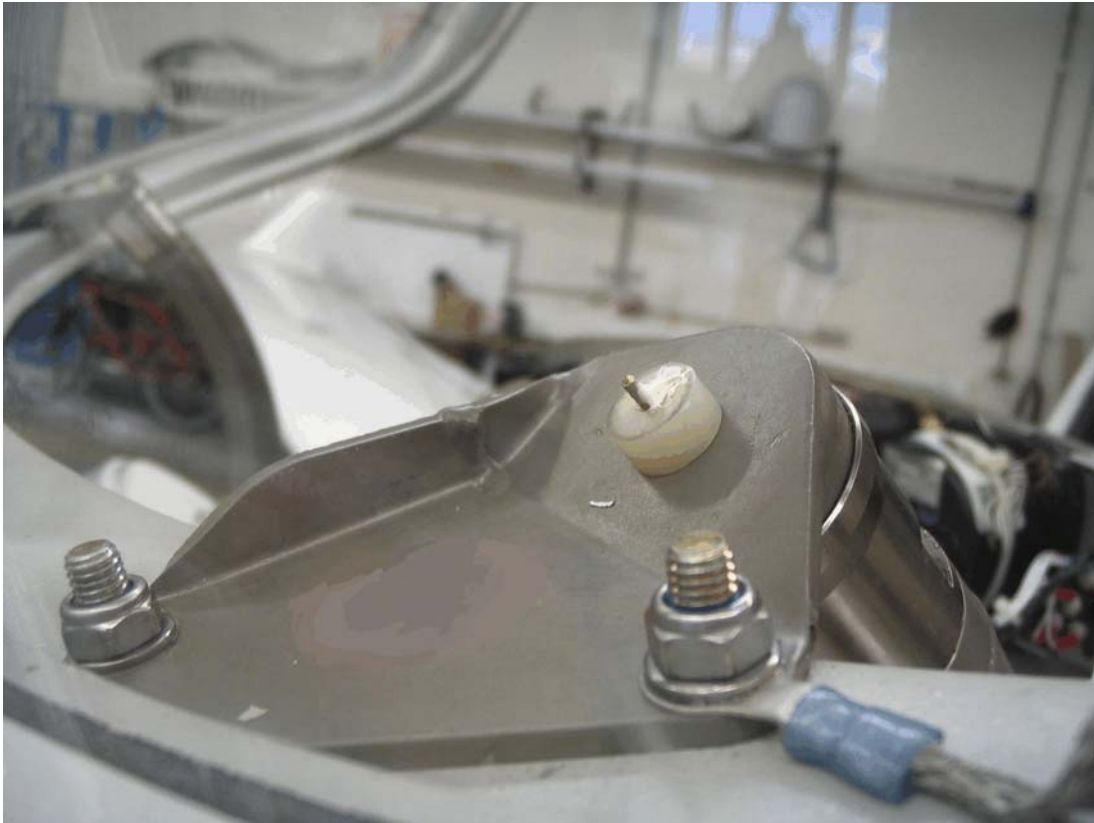
Canopy hinge on forward LH side