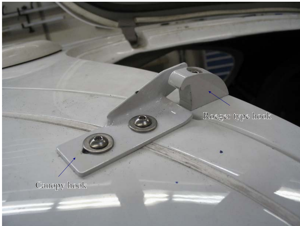
Canopy hooks on upper LH side