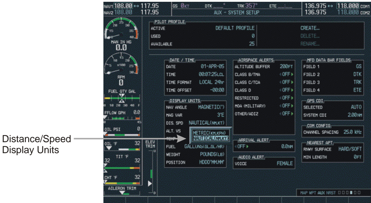
Figure 2. AUX-System Setup Page Distance/Speed Setting