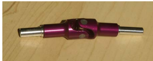
Picture 2: Old Joint D41-2823-20-00 rev. "a"