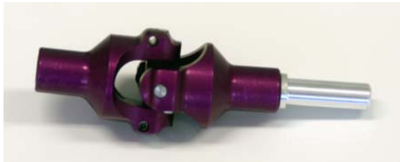
Picture 1: New Joint D41-2823-20-00 rev. "a" or later