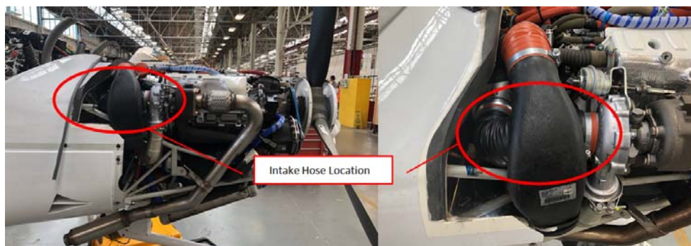
Figure 2: Intake Hose Location in DA 40NG Aircraft